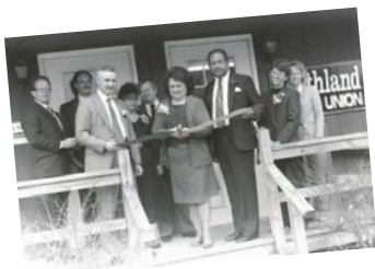
One of our earliest ribbon cuttings!

We came into the world as Wurtsmith Federal Credit Union on October 23, 1957, when a small, determined group with less than $100 of combined funds organized a credit union to serve the people of Wurtsmith Air Force base.